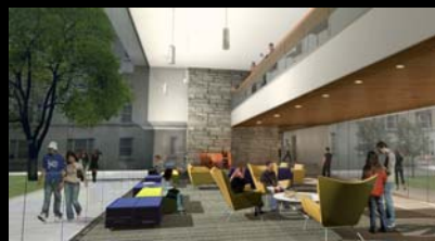
Concepts for South High Rises Renovation and Addition