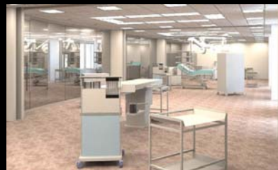
Prior Health Sciences Library Renovation for simulation and clinical skills labs

Major investment in facility modernization and expansion in interdisciplinary work in Chemical Engineering and Health Sciences