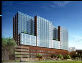
ProjectONE Cancer and Critical Care Tower

State of the art classroom and research space in North Academic Core (Chemical Engineering and Chemistry) and the OSU Medical Center will assist in recruitment and retention of best talent